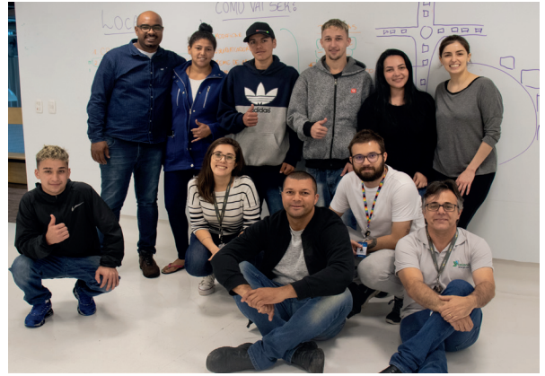
Figure 2. Meeting for the collaborative creation of the project, at the university

residents of the community where the technological intervention would be carried out.