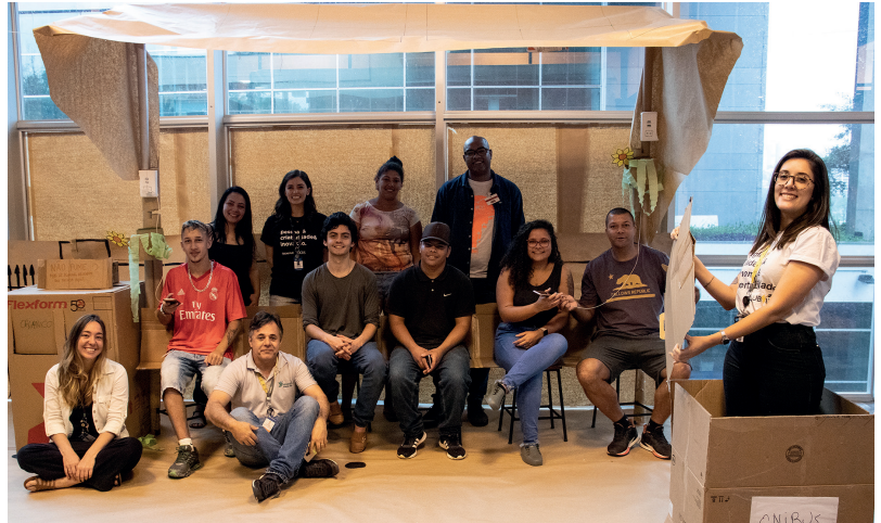
Figure 6. Work group and the sun stop prototype.

In the retrospective meeting it was possible to identify the benefit of the interactions for the work group. We noticed that people felt emotional regarding the process, showing surprise and satisfaction to have had interactions in an unusual group. Overall, the young people felt welcomed and satisfied to see the result of their work consolidated into a life-size prototype. For us, as designers and researchers, it was rewarding the possibility to be part of the field, to collectively build a process, and a product that proposed to create impact in a community that, territorially, we are not part of, but we are touched.