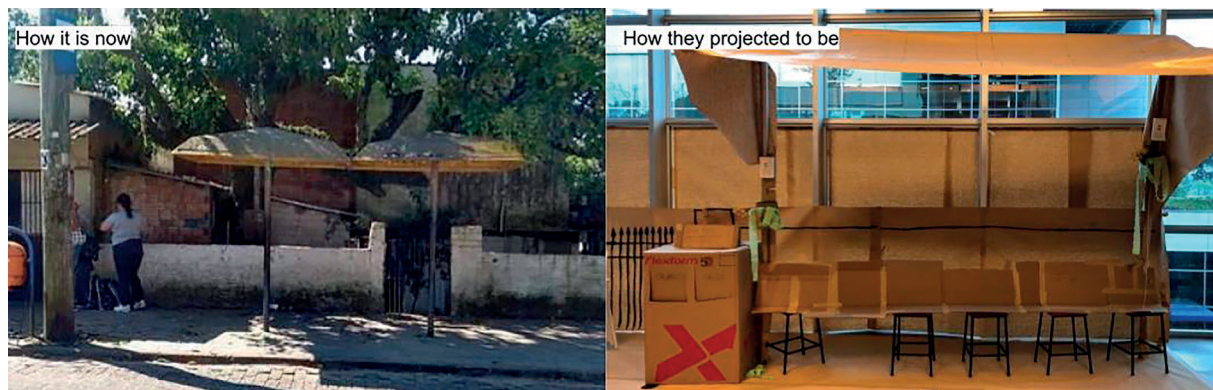
Figure 5. Comparison of the actual bus stop and the idealization model

More than performing a technological intervention in Morro da Cruz, the Parada do Sol project aimed at creating something that would have a positive impact on the community. For us the value of a solution is directly linked to the value perceived by the community, so we sought a process of Participatory Design. More than us as researchers and designers inferring about the field, we sought to bring the community leader, partner companies, and mainly, the youth from Morro da Cruz to create a solution together. The approach aiming at the horizontal participation of everyone relates directly to Ingold's (2012) concept of skilled practitioners since it perceives everyone as equally capable of being creative and socially transforming a reality. In addition to the insertion of everyone in a non-hierarchical process, we worked with a non-established process, aiming to create the steps as the need of the field showed itself to us.