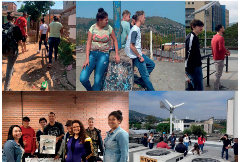
Figure 3. Some of the group's meetings at community exploration and training times