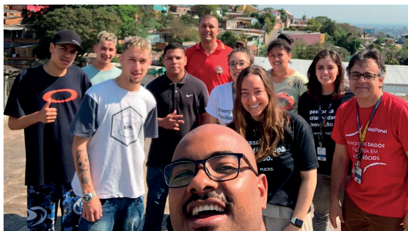
Figure 1. Work team at the community.

Based on the concept of DA, this project was developed from a collaborative process using concepts of ethnographic research as a tool for exploring the field of research based on observant participation. The methodological approach is built from the understanding of DA that brings the idea of researchers being part of the field they are researching. In this way, the methodological course sought to unite the knowledge of designers and